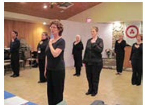
Sacred dance performed at our Annual Living Ethics Conference in Prescott, Arizona

by the Nicholas Roerich Museum and the Agni Yoga Society (New York City), which can find you spending many, many hours immersed in the studies of Agni Yoga, plus enjoying the masterful paintings and writings of Nicholas and Helena Roerich: http://agniyoga.org/ay_en/search.php and http://www.roerich.org/