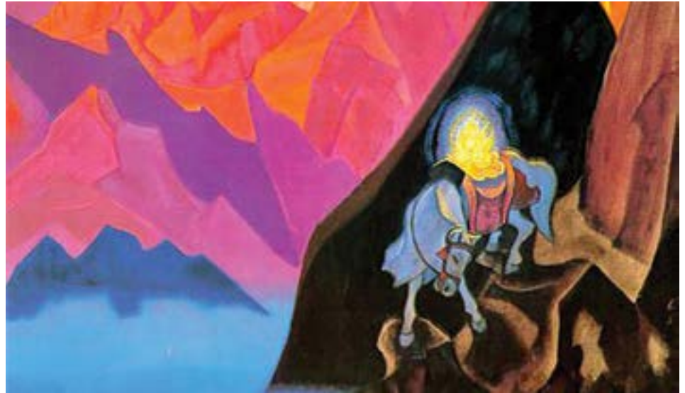
Treasure of the World (Chintamani) by Nicholas Roerich, 1924

“The spirit of Blavatsky accumulated knowledge over many centuries. That is why she could compile The Secret Doctrine and bring into the world confirmation of and lost knowledge about the existence of the Great Brotherhood. One should never make comparisons; who can understand or know the dif-