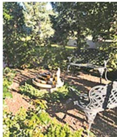
Izvara meditation garden

Ethics, including Death and Transition , Obsession and Possession , and Ailments and Remedies . These compiled booklets are all indexed. Additionally, you can meet students of Agni Yoga on the WMEA sponsored Facebook Page, https://www.facebook.com/groups/Agni.Yoga.Living.Ethics.Community/ . And of course, there is our publication Agni Yoga Quarterly . The archives of the Agni Yoga Quarterly can be found here https://wmea-world.org/wmea/agni-yoga/ .