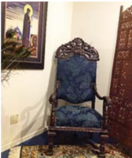
Sacred Chair in Izvara Center

October is celebration month for the White Mountain Education Association! October 2019 brings the annual celebration of the founding of this most beautiful community. This year the WMEA will be celebrating the thirty-seventh year of its founding. We were legally established as a non-profit, federally tax-exempt, educational/religious organization in 1982;