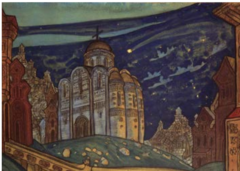
Putivl Eclipse by Nicholas Roerich, 1914

X-rays respond to the Sun's rays. Upon your departure from India, the new Sun will reveal a circle with emanating rays. This circle will appear for three days as a reflection of the distant Sun. Such a passage of it through our system causes a strong perturbation of the entire system. The ardent comet will reappear again in 195[...] at the time of your departure. The rays of the New Planet inflame all mucous membranes. The visibility of the New Planet is hidden from us by the Sun's rays, for the ardent one has come too close to the Sun. The visibility of the ardent comet is hidden by the rays of the Sun. The core of the planet contains new metalloids, which are very strong and provoke explosions in the atmosphere surrounding the planet. The ardent planet is revealed at a triple tensio.