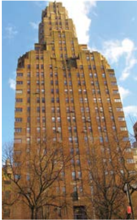
The Master Institute of United Arts building

But besides the awakening of the sense of beauty and veneration of culture, Prof. Roerich and his wife, Helena Roerich, brought another even greater gift to mankind: the