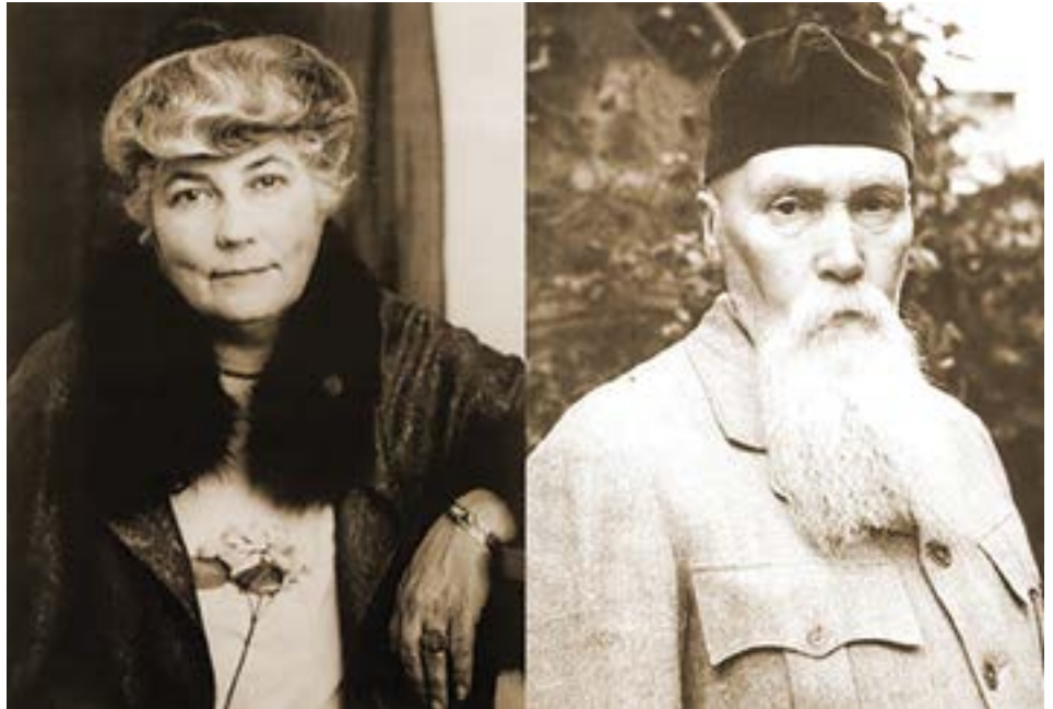
Helena and Nicholas Roerich

Humanity is never left alone, but, on the contrary, spiritual and practical help is poured constantly from the Great Source of Hierarchy upon our Earth. Literature abounds in examples testifying to the reality of this statement. People, nations, movements, groups, individuals are not abandoned. The current of ageless wisdom, applicable to everyday life and to man's self-perfectedness is flowing endlessly. If our consciousnesses are open, if our ears and vision are attuned, if the striving for Knowledge, Beauty, and Truth are present, the gates are opened. But we must knock ourselves, and the knocking one will be admitted , says Agni Yoga.