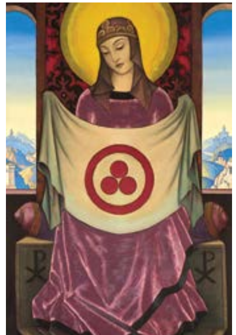
Madonna Oriflamma , by Nicholas Roerich, 1932

After their return in 1929 from the Central Asiatic Expedition, Prof. and Mme. Roerich chose Naggar in Kulu Valley, India, as their place of residence and as the best site for a scientific institution, which was founded by them under the name of the Urus-