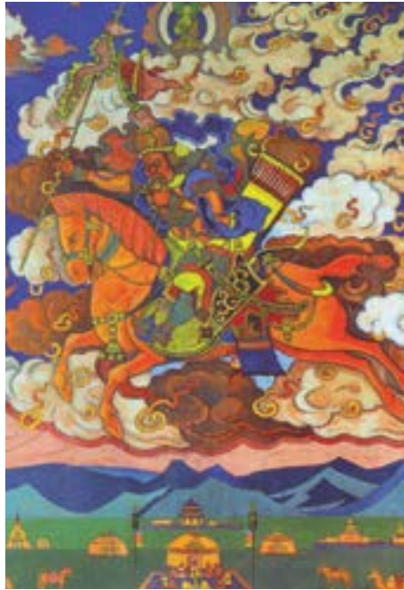
Great Rider, Rigden Jyepo – Messenger of Shambhala, 1927, by Nicholas Roerich

Oxygen is one of the manifested infinite differentiations of the fiery substances that