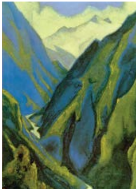
Ganges (Cold Ravine) , 1946, by Nicholas Roerich

genitors," 6 (the Lords of the Moon), "also called 'Self-born'—was, in our sense, speechless, as it was devoid of mind on our plane." 7 "Multiplication of these beings was by fission, or by budding. . . . They grew, expanding in size, and then divided, at first into two equal halves, and then in their later stages into unequal portions budding off progeny smaller than themselves, that grew in their turn and again budded off their young." 8