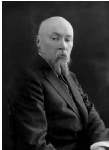
Nicholas Roerich, Paris, 1923

“When a person sits quietly in a chair with closed eyes, and his thought is not occupied with anything serious, then his brain matter produces regular electrical discharges at the rate of about ten discharges per second. With the help of a very complicated and ingenious apparatus and a photoelectric camera, Prof. Adrian succeeded in registering these discharges on a cinema film. He likewise observed that as soon as his patient opens his eyes and begins to concentrate his attention on something, the frequency of the electrical discharges increases considerably and reaches usually about two thousand per second.”