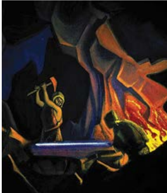
Forging the Sword (Nibelung) , 1941, by Nicholas Roerich

One should keep in mind that the saturation of space is very high when the Sun enters a new constellation and its rays become saturated with the new chemism of that particular constellation.