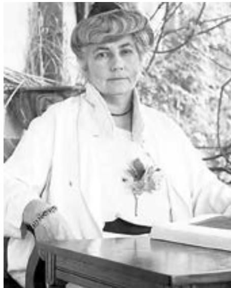
Helena Roerich, Naggar, India, 1930s

Science might engage in the study of the solar ray, or more specifically, of its composition. Such a new, remarkable science would allow forecasting of the weather a whole month ahead or for each new moon. Thus, the solar ray not only controls weather but serves as well as an indicator of contractions in the planetary core. Contractions are accompanied by convulsions of the crust, earthquakes, and floods, which may become terribly destructive and may even change the inclination of the Earth's axis if cracks in the Earth's oceanic crust turn out to be very deep.