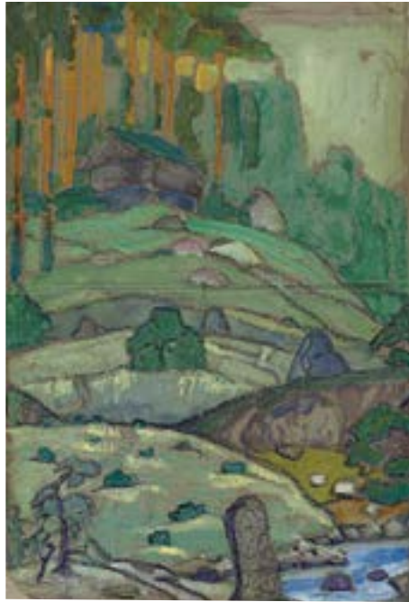
Hills , 1912, by Nicholas Roerich

There were “three stages of the [T]hird Race. First, the sexual form; the second, hermaphrodite; the hermaphrodite is divided into two sexes,