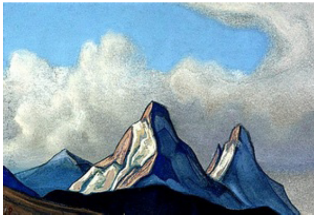
Tibet by Nicholas Roerich

talk in a way that the Teaching will heal someone’s heart or inspire a depressed person. She will consider how she can bring joy into the atmosphere of her talk. She is not in a hurry; she is not going to “hurry up and get it done.” She will spend all the time she needs to perfect her talk. Each time she presents a lecture or writes a paper, she will strive toward