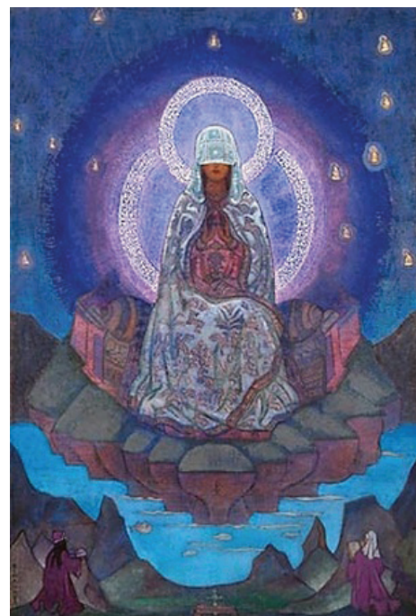
The Mother of the World by Nicholas Roerich