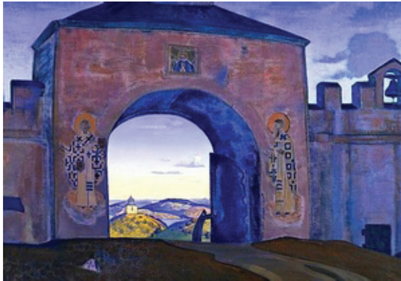
And We Open by Nicholas Roerich