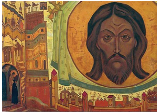
And We See by Nicholas Roerich

5. The Great Invocation. Daily, sound the Great Invocation as a service to Humanity. Alice Bailey told us that the Great Invocation does not belong to a person or a group but to all Humanity. The beauty and the strength of this Invocation lies in its simplicity and in its expression of certain central truths—the truth that behind all outer seeming, the motivating power of the