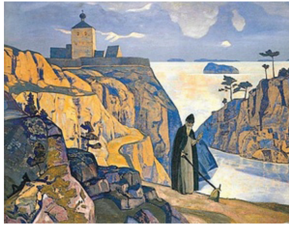
Holy Lake by Nicholas Roerich

Some teachers will try to shame you, condemn you for what you have done; they