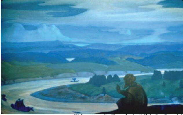
Welcoming the Traveler by Nicholas Roerich

in service, in study, in striving on the Path of Perfection, our hidden potentials, our hidden treasures will unfold.