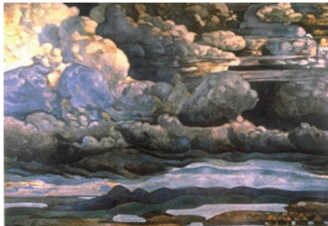
Battle in Heaven by Nicholas Roerich

We cannot go anywhere on the spiritual path if our conflicts continue. "We pray for light to descend upon us. Then the next moment we lie and gossip and say things