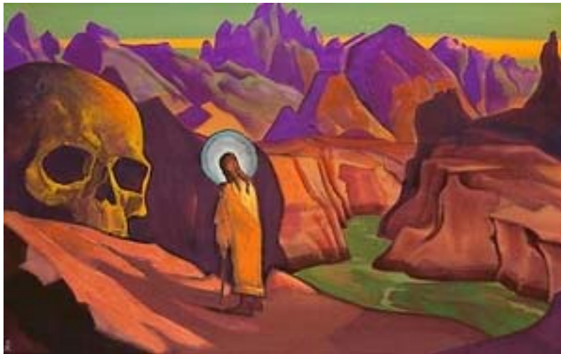
Issa and the Giant Skull by Nicholas Roerich

see a similar pattern in the way attacks were made against them, in the way they confronted the attacks, and in the way they unfolded, developed, and bloomed spiritually because of them. Christ never promised a life of luxury and comfort to His disciples. On the contrary, at every moment He spoke about dangers. He lived in a very dangerous situation and trained His disciples to love danger, because it is almost