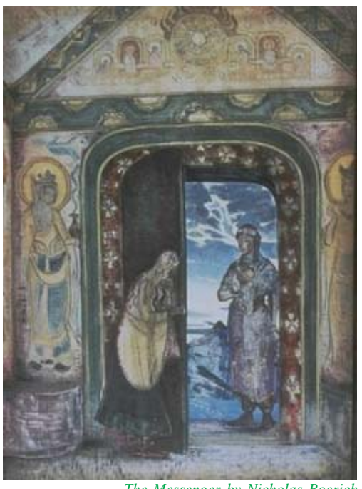
The Messenger by Nicholas Roerich

Wisdom and faithfulness to an ideal or a friend go hand in hand. Wisdom synthesizes your intelligence with your pure love to meet others' needs, and faithfulness makes you stand firmly by them till the need is met. A disciple must be wise and faithful to his commitment and accepted responsibilities, otherwise he will not only be unwise, he will commit treason.