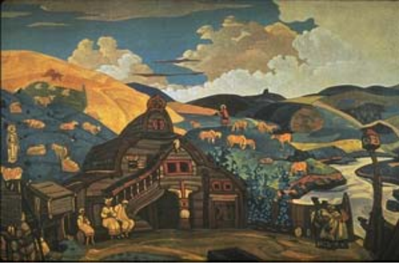
Pier Gint set design by Nicolas Roerich