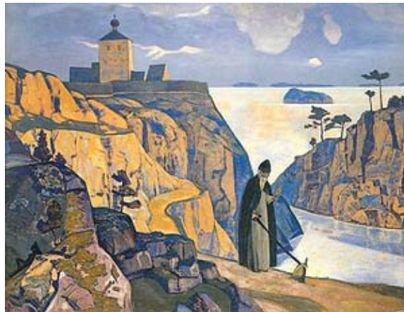
Holy Lake by Nicholas Roerich

Heart, 4. The heart is a temple, but not an abode of idols. Thus We are not against the construction of a temple, but We object to fetishism and to bazaars. Likewise, when We speak of constructing a temple like a heart, We do not mean that it be of heart-shaped design. We speak of its inner significance. A temple cannot exist without realization of the infinite chain; so, too, the heart contacts all the sensations of the Cosmos. The heart's