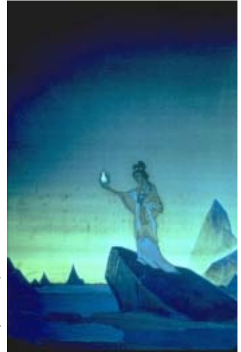
Agni Yoga by Nicholas Roerich

The universe as we know it has a beginning and an end: "It is a natural law that the whole existence is in a process of birth and death. This is very beautifully explained in The Secret Doctrine , where Blavatsky describes it as a process of in-breathing and out-breathing. Some Great Existence exhales, and creation