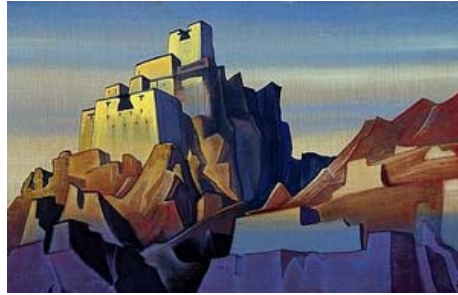
Castle of Ladakh by Nicholas Roerich

"When I was a child, I used to speak as a child, think as a child, reason as a child; when I became a man, I did away with childish things." (1 Corinthians 13:11) A child is given toys to stimulate the child's ability to learn.