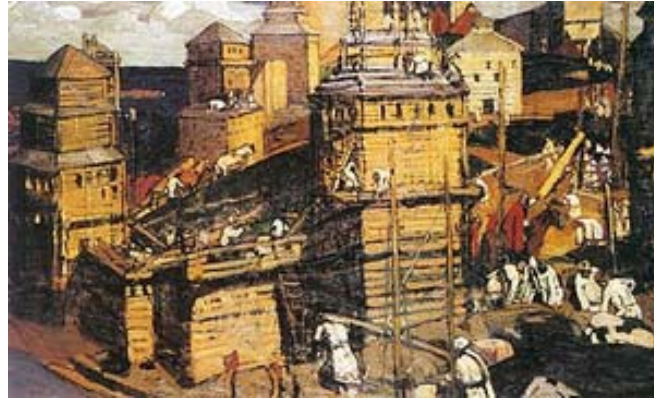
Boat Yard by Nicholas Roerich

At night our eyes adjust to seeing in very little light and we say that we can see. In practicing Hatha Yoga, we can fool ourselves into thinking that we have contacted Light, when what we have contacted is just a little less darkness because we seem to have taken a