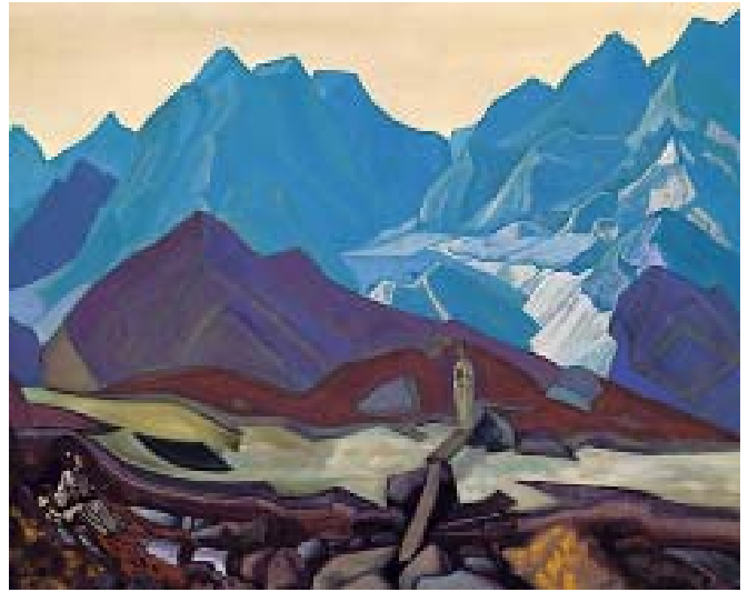
From Beyond by Nicholas Roerich

The UNA-USA Council of Organizations is a program of affiliation for non-profit organizations that share a common interest in the United Nations. The group consists of more than 100 national organizations of all kinds — educational, religious, labor, environmental, relief, and others. Council members work with these organizations to encourage public awareness and involvement