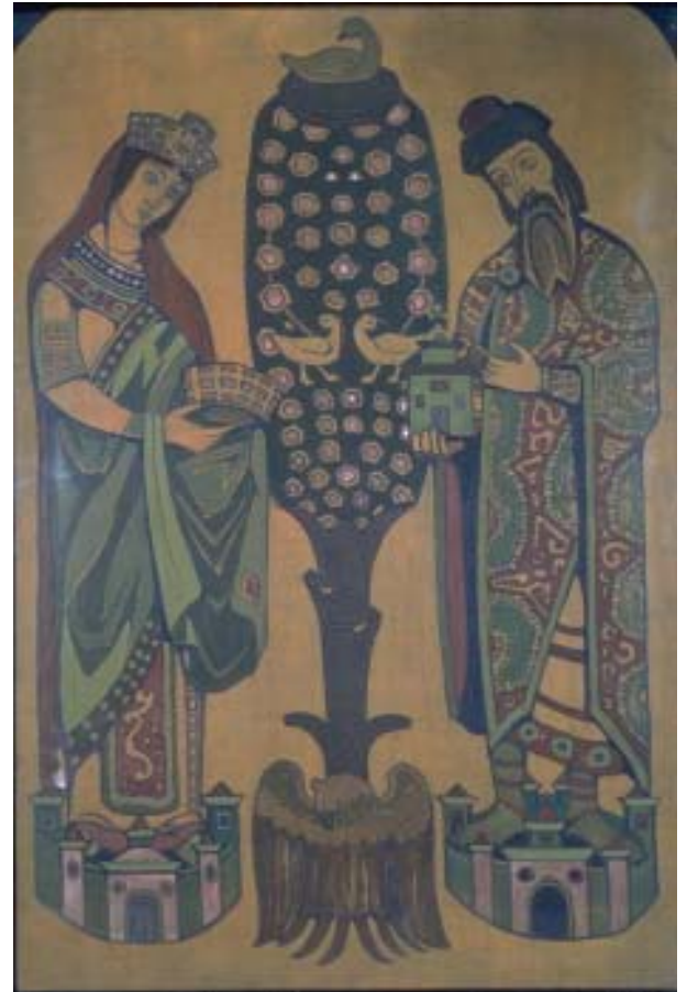
From Negotiations by Nicholas Roerich