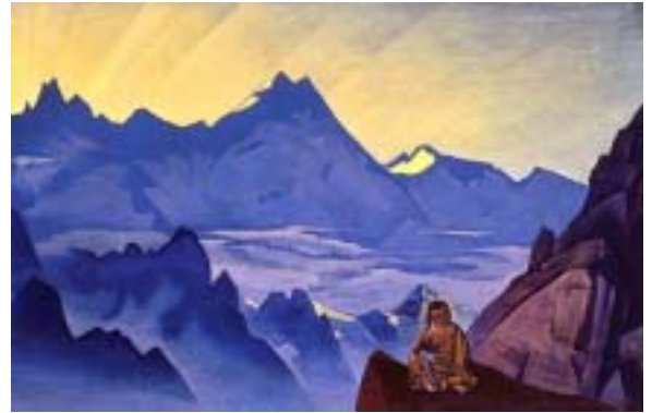
Milarepa by Nicholas Roerich ©

Think what happens when a Teacher, a greater Light, comes into our life and stirs up some trouble. Do we react or respond? Do we find ourselves with resistance? Do