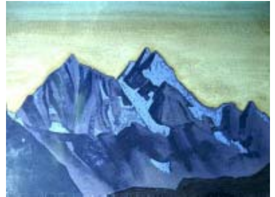
The Path to Kailas by Nicholas Roerich

Many people have a glamor about attending the Wesak Festival. But actually until our lives are constructed from the fabric of service, selflessness, solemnity, and used as an instrument of the Great Ones, it is more important to work on ourselves and get our