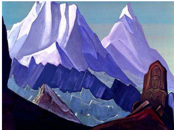
Maitreya by Nicholas Roerich

while moving the human consciousness along the new evolutionary lines, preserve the bond with the Arhats and fulfill Their Will. The manifoldness of the tasks requires various conditions. Therefore, some of the Arhats remain in the densified astral form, and only a small group of Them, because of special missions, preserve their physical bodies. Verily, the burden of their work for the General Good is beyond the imagination!