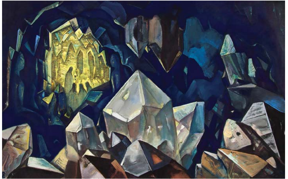
Most Sacred Treasure of the Mountain , Nicholas Roerich, 1933

“The Envoys who are sent by the Hierarchy of Light, to bring urgent advices, warnings and counsel into various countries, with complete self-abnegation, always fully realize the sacrifices, impediments, obstacles and even martyrdom which humanity will strew in their paths. It was so through all the history of humanity. St. Germain came to ward off revolutions, upheavals, catastrophes, and He received derision, refusals to listen, and finally the title of charlatan .