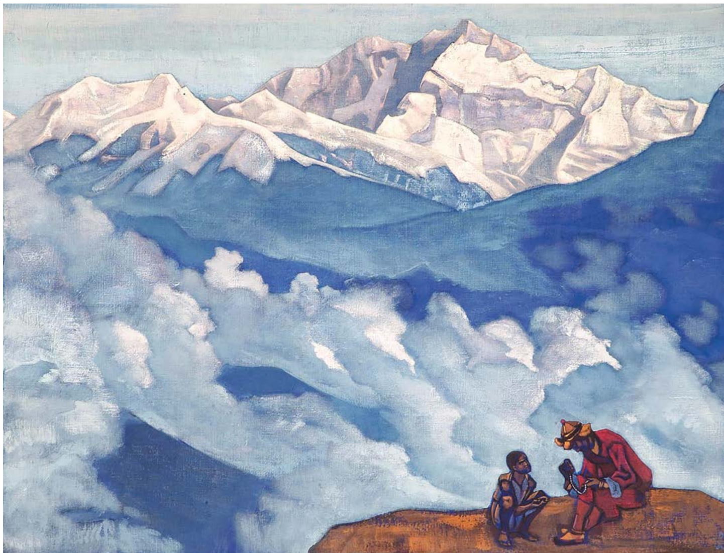
Pearl of Searching , Nicholas Roerich, 1924

Roerich founded a school of arts, called Master School of United Arts. Subsequently there were founded the Roerich Museum, Agni Yoga Society, International Art Center, and later the Roerich Pact and Banner of Peace Committee. Thus was the cornerstone of deeper and greater appreciation of culture laid into the soul of America. This was one of the endeavors of their great Mission.