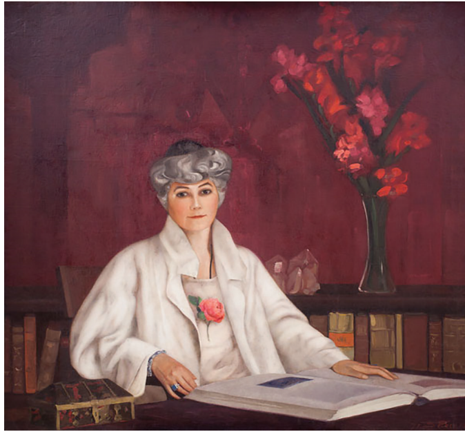
Helena Roerich by Sveteslov Roerich, 1937

Using their own natural emanations, people can create a store of new vitality. The energy scattered throughout space can be directly apprehended. This is why it is necessary to pay attention to the development of psychic energy. This is why the City of Knowledge, high in the mountains, is so needed. ( Agni Yoga , verse 229)