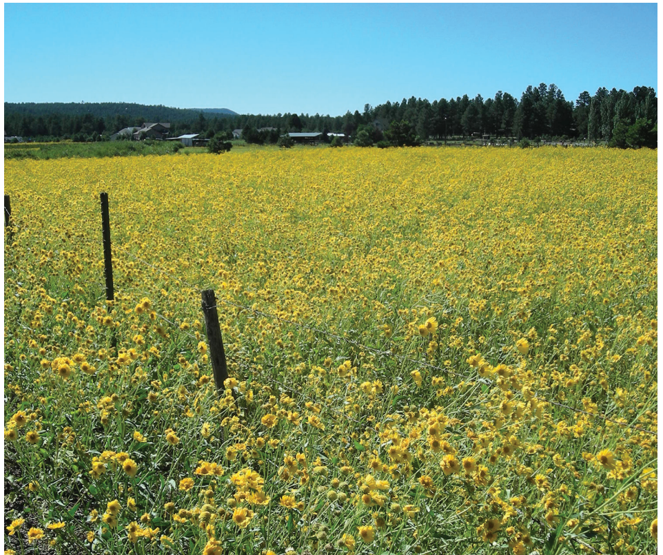
Fall flowers in full bloom: Flagstaff, Arizona – Photo: L.A.

painting and sculpture, I may have succeeded. If a person were to bang on a pie tin with a metal spoon, is that music? No, it is noise, because there is no tonality, harmony, or rhythm.