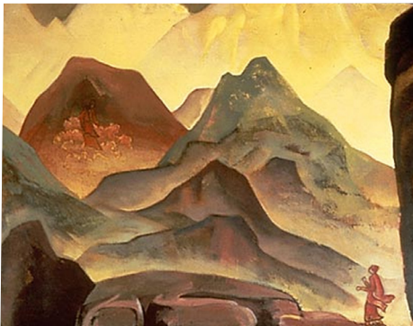
Vision by Nicholas Roerich, 1923

Conference week will focus on the theme of “The Coming Cosmic Shocks: Spiritual Readiness.”