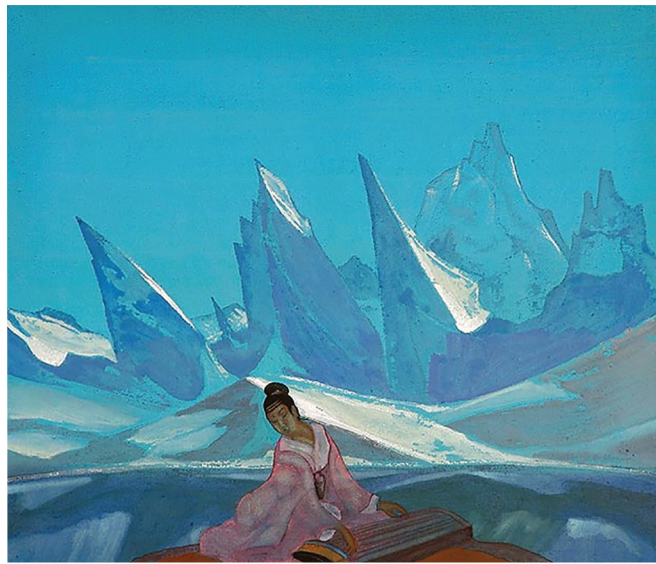
Kuan-Yin by Nicholas Roerich, 1933

of Samadhi?" The ignoramus will ask this question. How could he know that this supreme state is not only unrelated to selfhood but antithetical to it! How could one who has never experienced the highest tension apprehend that that, precisely, carries the highest Bliss for the General Welfare! Nothing gives birth to such pure abnegation of self as that induced by the exultation of the brimming heart. Which