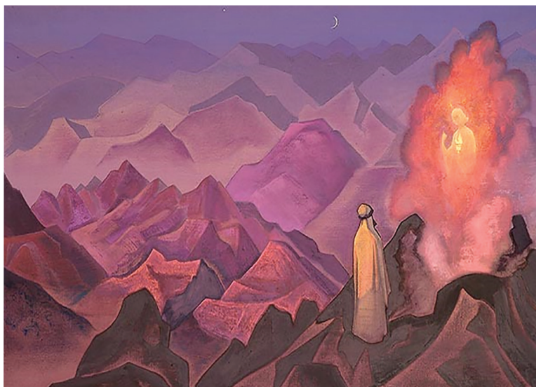
Mohammed the Prophet by Nicholas Roerich, 1932

Fiery World I , 106. The master smelter counseled the new worker on how to approach the fiery furnace. But the worker's only concern was to learn the chemical composition of the flame. The master said to him, "You will be burned alive before you reach the flame. Knowing the chemical formula will not save you. Let me give you the proper clothes, change your footwear, shield