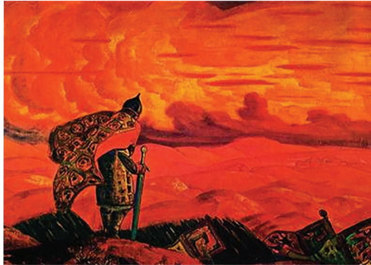
Arrows of Heaven, Spears of the Earth , by Nicholas Roerich, 1915

the Subtle World, when their memory has been clarified? Not shame before others, but the unquenchable bitterness of infamy in the heart drives the traitors into ice and flame. And where are those who whispered treacheries into their ears? Why do they not succor their issue? They do not seek them out in the darkness. Terrible is the condition of traitors—murderers of body and spirit!