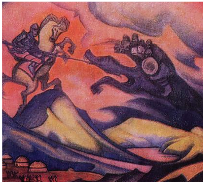
Bum-Erdeni by Nicholas Roerich, 1947

be regarded as treason, for out of them issues the lowest. One should understand how unavoidable for oneself are their consequences. A small consciousness is engulfed in mistakes and, trying to justify itself—in other words to lie to itself, actually sinks to the bottom. It can be observed through many lives how the garden of effects blossoms. Sooner or later one must be convinced of the harm