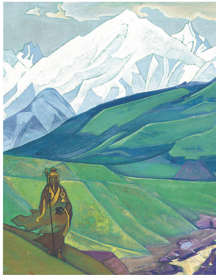
En-No-Gyoja, the Friend of the Travelers, by Nicholas Roerich, 1924

Hierarchy, 202. It is premised that around good deeds difficulties always arise. What does this prove? Does it prove