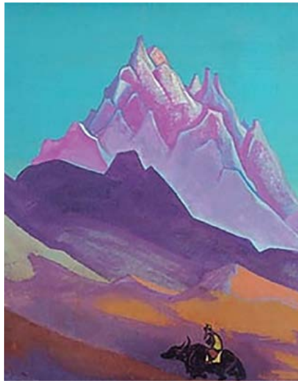
Pilgrim by Nicholas Roerich, 1932

Brotherhood , 111. Good deeds are like different flowers in a meadow. Among the healing ones there may be others which are quite brilliant but poisonous. Among the wonderful manifestations there may be found extremely deadly ones, but only by experiment is it possible to make a just selection. Insincerity contains a destructive poison. It can be observed that a construction built upon falsehood degenerates into hideousness. Much is being spoken about good deeds, but they must be truly good. Let people search the depths of their hearts as to when they have been good. No mask can conceal the ugliness of a skeleton of falsehood. Let us not condemn, for each one has already condemned himself.