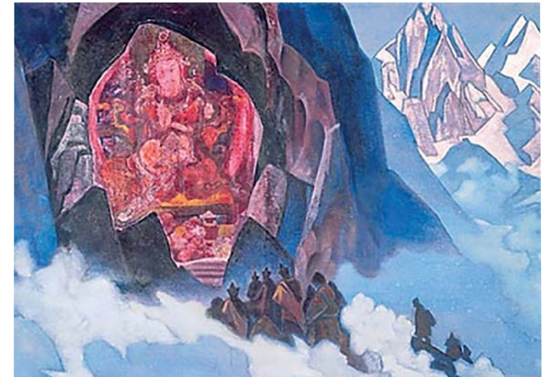
Order of Rigden Jyepo by Nicholas Roerich, 1927

between absolute devotion and conditional devotion. Most often people display absolute devotion when they receive, but each act of giving in return is difficult because of self-imposed conditions. Some accept what they have been given, but then raise obstacles in their own consciousness, and begin to think that the given treasure is but a piece of mold! One should remember that the measure of one's devotion determines the measure of receiving. Faith must be equal in degree to knowledge. Each