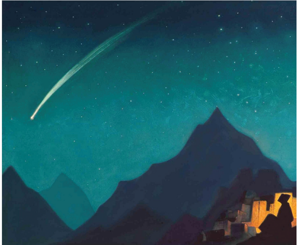
Star of the Hero by Nicholas Roerich, 1936