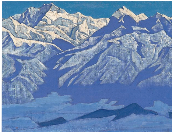
The Range by Nicholas Roerich, 1924

Illumination , II-I-13. I rejoice to see how you understand the details of My Decrees. I prepare an event, far-seeing all details. Act likewise, as thus it will be easier for us to meet each other.