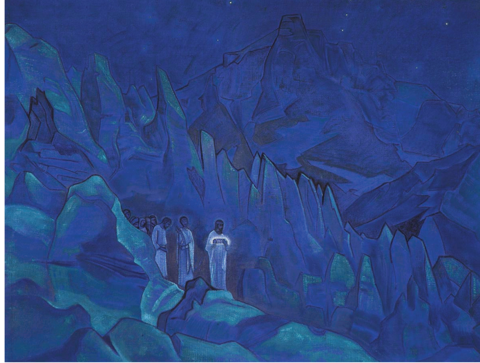
Burning of Darkness by Nicholas Roerich, 1924

interesting that even strong voices or thoughts can be distorted by a single sound. Thought resounds, but people do not understand this, and do not perceive that a word that is emphasized mentally will resound more clearly.