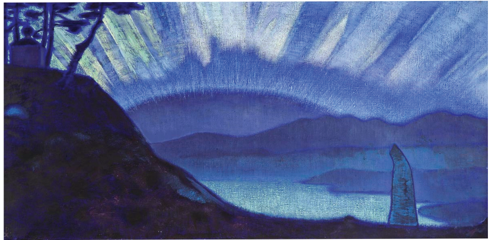
Bridge of Glory by Nicholas Roerich, 1923

Subtle World may be difficult; even an experienced consciousness may meet obstacles. Today Urusvati experienced such a difficulty. An effort was needed in order to pierce chemical strata which are formed by astrochemical fusions. The days around full moon are not favorable for flights. The so-called lunar glass can