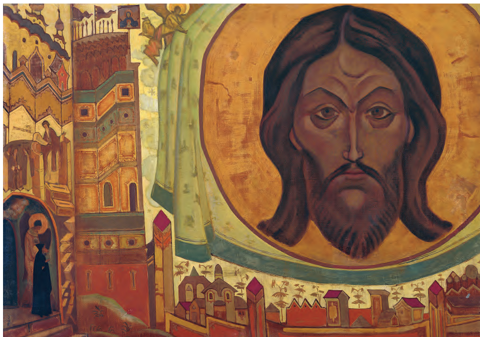
And We See by Nicholas Roerich, 1922

the steadfast ones. Weakness and light-mindedness foster treachery.