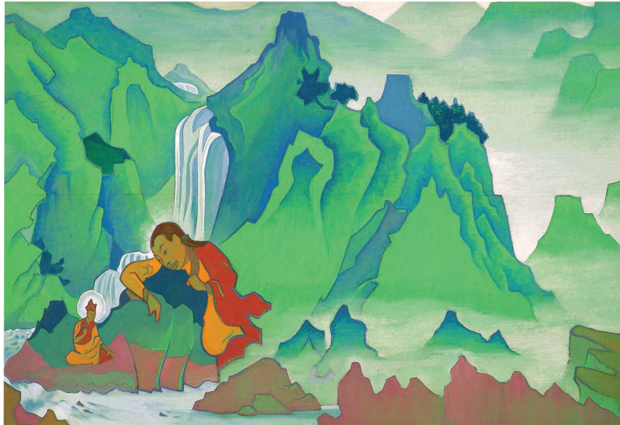
Padma Sambhava by Nicholas Roerich, 1924

of the Lord is alone insufficient without devoting the heart to the Lord. One must understand that law which unites the Teacher with the disciple, because without the manifestation of complete attachment to the Lord there can be no