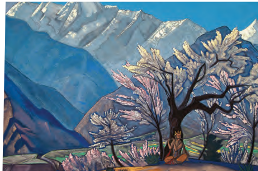
Krishna by Nicholas Roerich, 1929

Pure thought saturated with beauty points out the path to truth. The interdictions and the prescripts of renunciation in the Teachings were given in condescension toward a limited consciousness. But a broadened consciousness frees man from many fetters and affirms progress. Adorned lives allow departing freely and generously in order to return as victors. He who proceeds with a consciousness of beauty cannot be confused. Only confusion can bar the way.