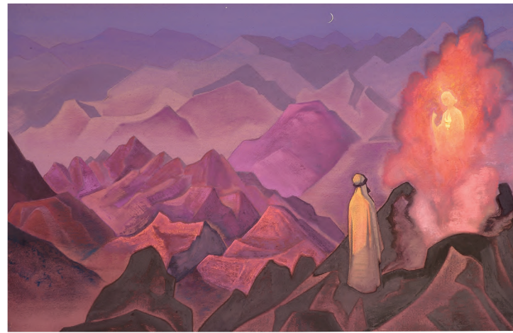
Mohammed the Prophet by Nicholas Roerich, 1925

great emphasis to the concept of the Guardian Angels. When thought can sense the proximity of a spirit from other spheres, why not accept the Image of the One who guides the destiny? When humanity will realize His power, it will cognize the significance of the true Guardians. The Guardian of Spirit, the Guardian of Truth, is the One who directs our steps into the Cosmic Space. Man can think about Guardians. Thus, a spirit close to Us can sense the Guardians in the Cosmic Space. Hence, creativeness of the spirit brings one to the close Guardians. Thus, let the strivings to the Guardians be maintained upon all paths. Sensitive receptivity affords striving to the Guardians.