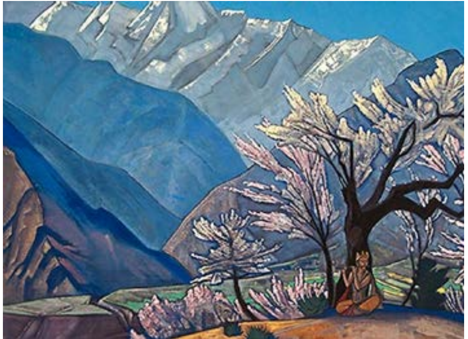
Krishna by Nicholas Roerich, 1929

the joy of helping and the joy of eternal perception. Patience always, in all, and everywhere. The Sons of Buddha, the Sons of Conquerors, Bodhisattvas, in their active compassion are the Mothers to the all-existing.” (Mahayana Sutra)