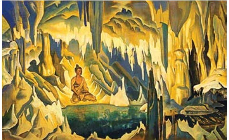
Buddha the Conqueror by Nicholas Roerich, 1925

Letters of Helena Roerich Book I , 20 December 1934. [M]any think that they possess cosmic consciousness, that they have been through the highest degrees of initiation, etc. etc. The self-conceit of people is a most tragic page in the