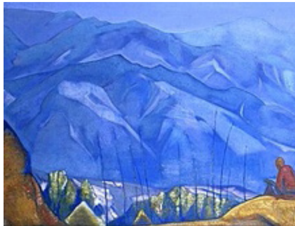
The Book of Wisdom by Nicholas Roerich

For example, there is a beautiful story about an old, uneducated man who was living in a cave in a remote mountain: