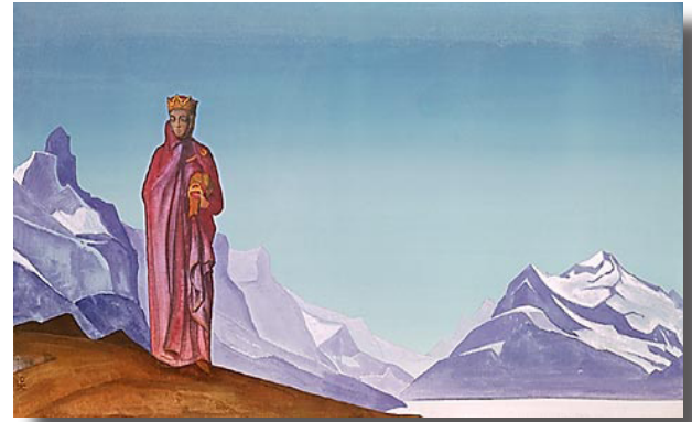
She Who Holds the World by Nicholas Roerich

The tests of the path reveal to you who you are, what you have and what you need to overcome. For example, there was a heart surgeon who was divorcing his wife. He went to his Teacher and said that he had met a very young girl and that he could not help himself—he